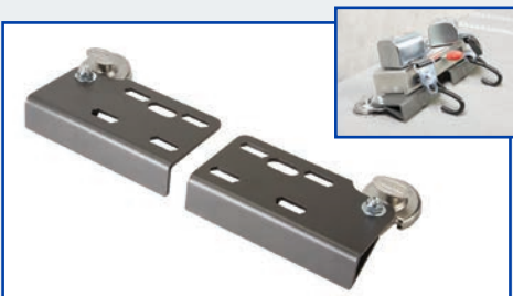
QS00014 Slide 'N Click

Kit Includes: (1) RH Floor Bracket (1) LH Floor Bracket (6) Bolts (6) Locknuts (12) Washers