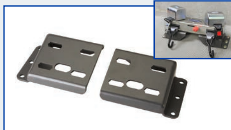
QS00032 L-Track Parallel

Kit Includes: (2) Rear Mount Brackets (6) Seat Anchor Assembly