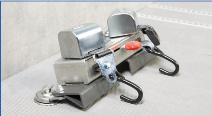
Q060002 Right Handed Unit

Each Unit Includes: Q'UBE Assembly, Bolts, Flat Washers, Lock Washers and Installation Instructions