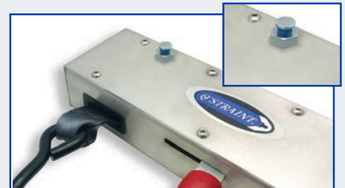
QS00023 Pin Connector Option

Kit Includes: (1) RH Leaf Bracket (1) LH Leaf Bracket