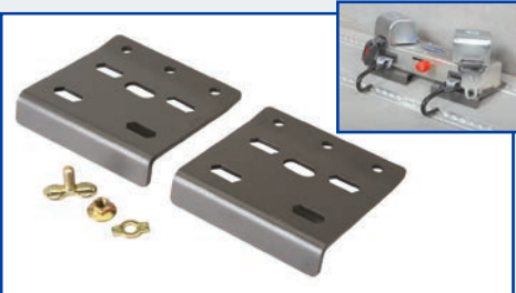
QS00034 L-Track Perpendicular

Kit Includes: (2) Rear Mount Brackets (6) Seat Anchor Assembly