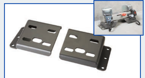
QS00033 Floor Bracket

Kit Includes: (1) RH Floor Bracket (1) LH Floor Bracket (6) Seat Anchor Assembly