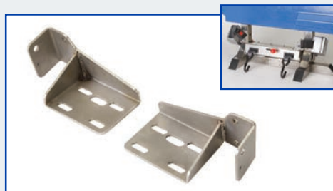
QS00035 Pedestal Mount

Kit Includes: (1) RH Slide 'N Click Bracket (1) LH Slide 'N Click Bracket